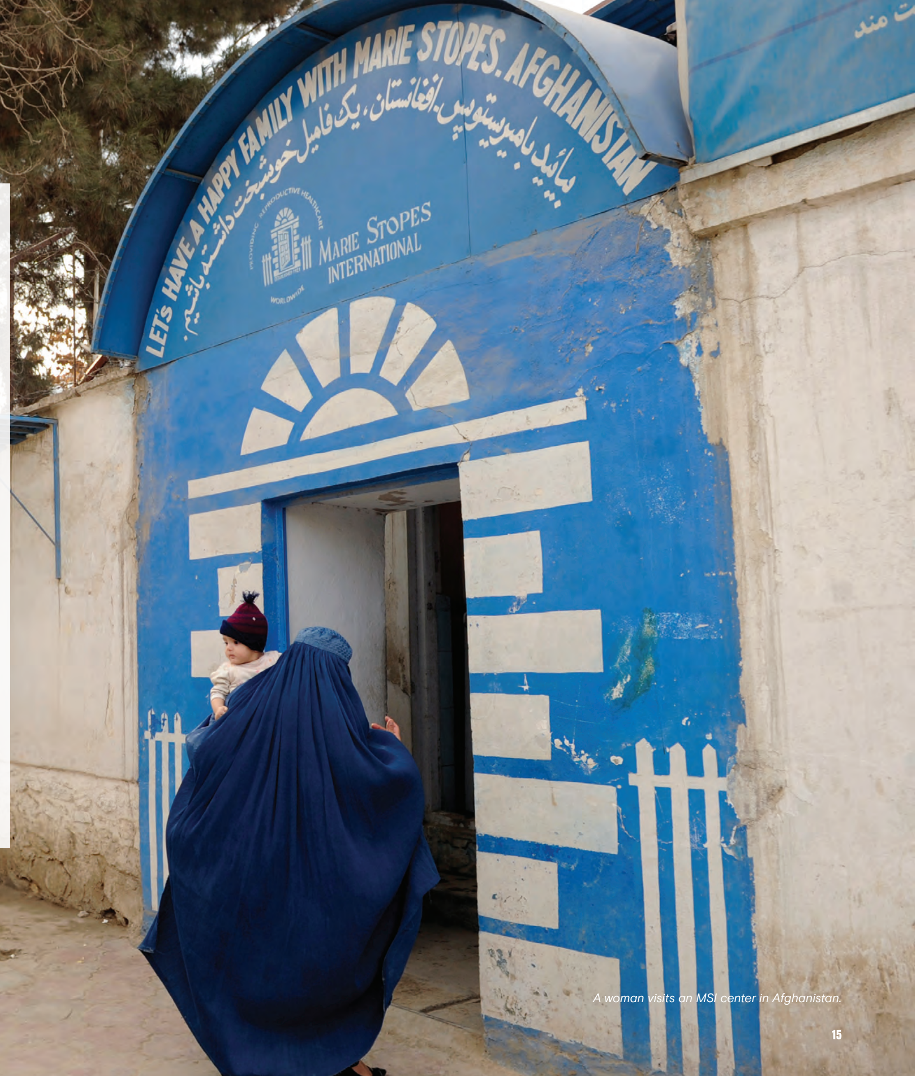
A woman visits an MSI center in Afghanistan.

Access to women's healthcare is empowering, cost-effective, and potentially life-saving. Bold providers like Haya are making choice possible, even in challenging contexts.