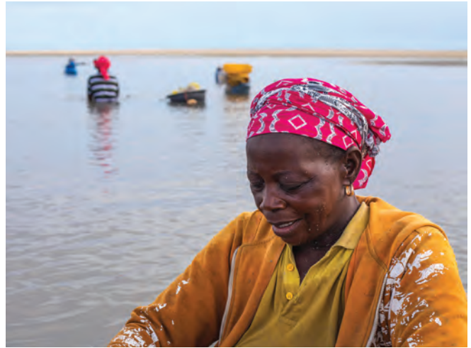
A woman gathers cockles from the mangroves in Senegal.

Reproductive choice and the climate crisis are inter-linked, and we’re working to develop programs that support climate adaptation and resilience.