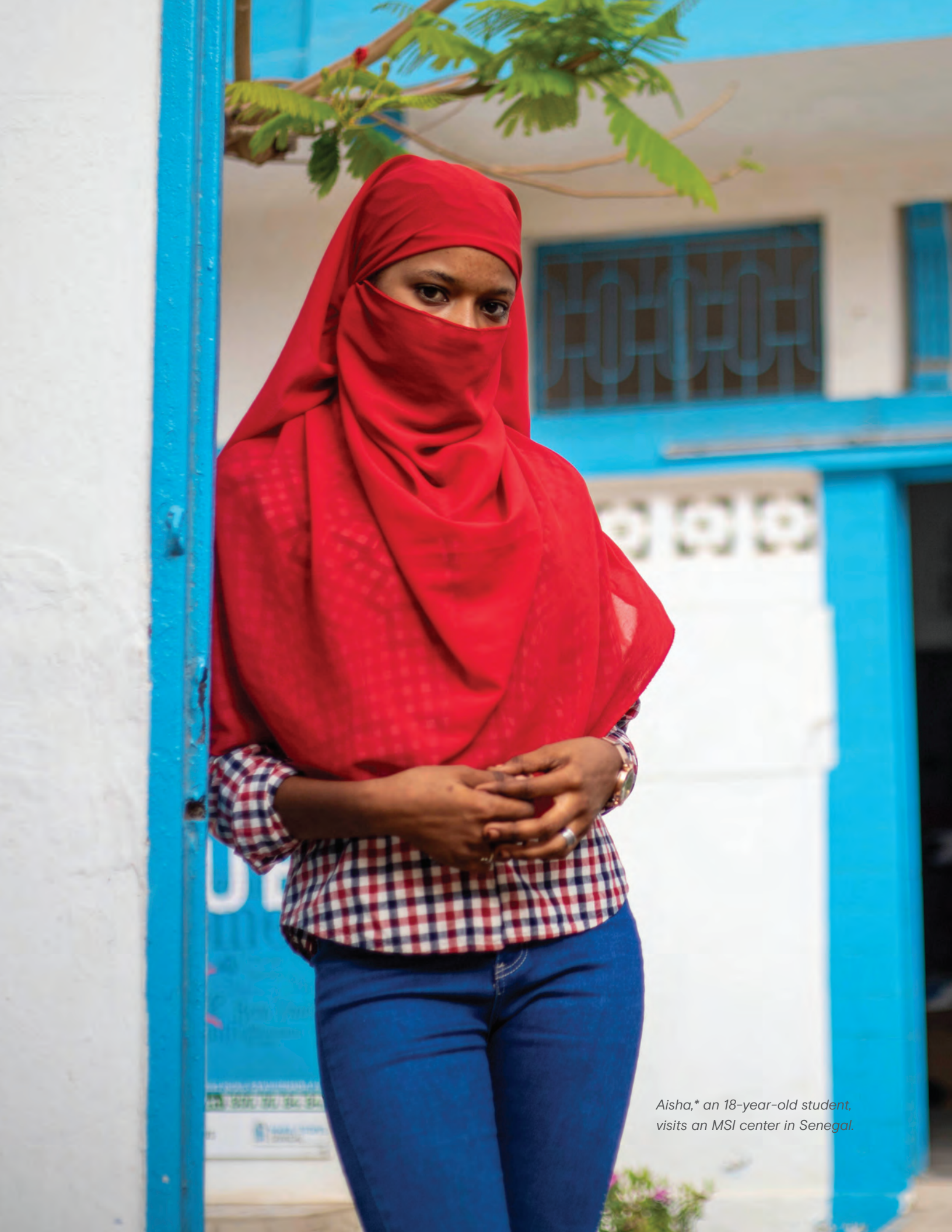
Aisha,* an 18-year-old student, visits an MSI center in Senegal.