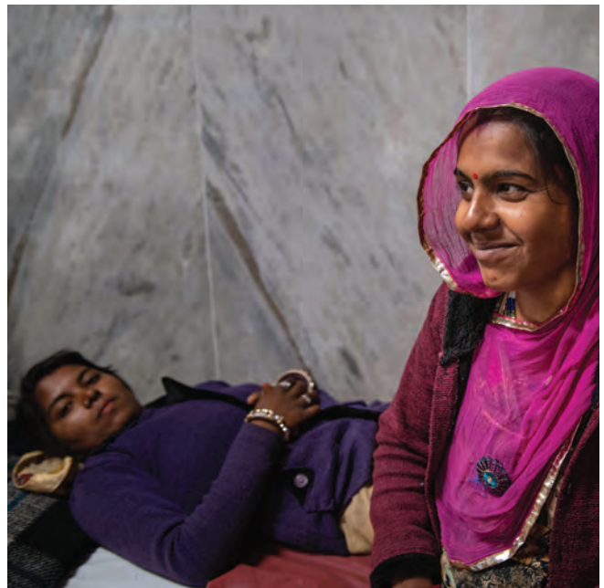
A client waits to see the nurse in Jaipur, India.

MSI's global network of contact centers provides free information, advice and referrals over the phone, social media and WhatsApp, supporting clients to make the reproductive choices that are right for them. Contact centers are ideally placed to provide a continuum of care for telemedicine and self-care clients, with advice on how to administer self-care products, expected side effects, and when and where to seek facility-based care. Our contact centers supported nearly 2.7 million client interactions in 2021.